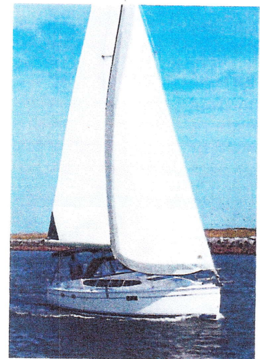
e36 Cruising Version